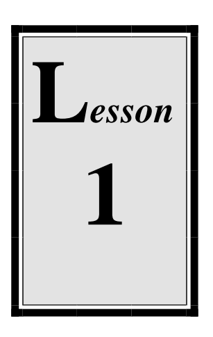
The Word of God